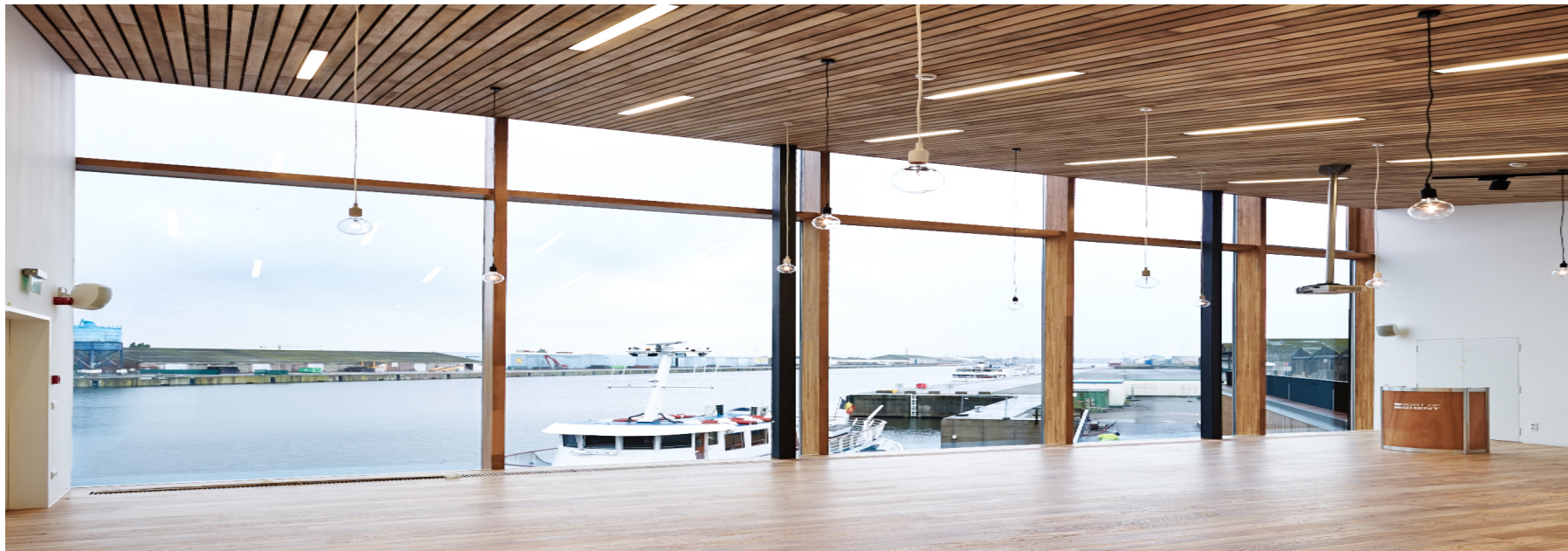
PORT OF GHENT – VISITORS CENTER